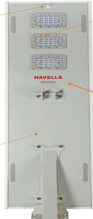
Extruded Aluminium housing